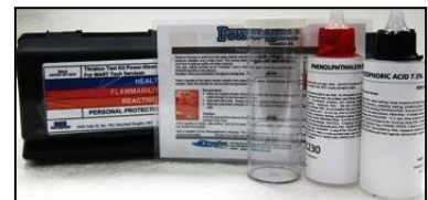
Titration Kit #22200