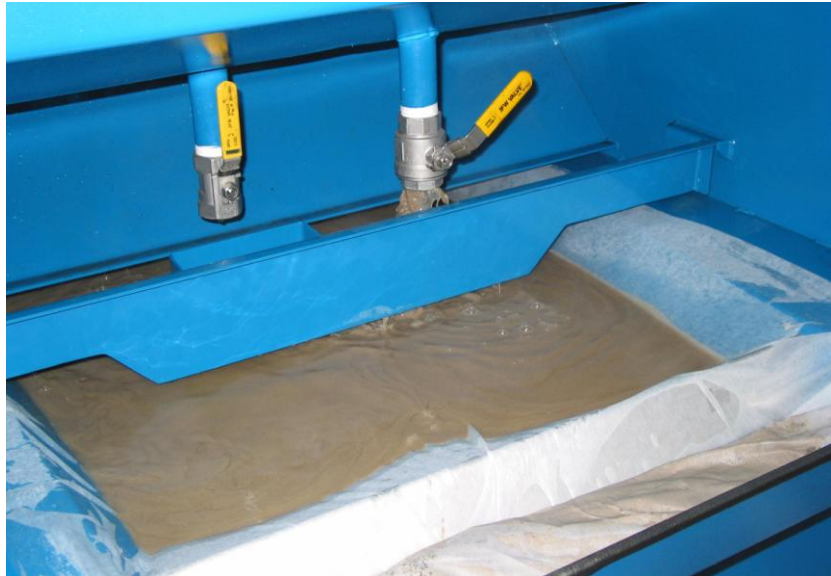
Draining encapsulated waste onto the filter paper

a) As the clear solution drains through the filter paper without the encapsulated waste discharge, slowly pull the filter paper forward over the platen divider.