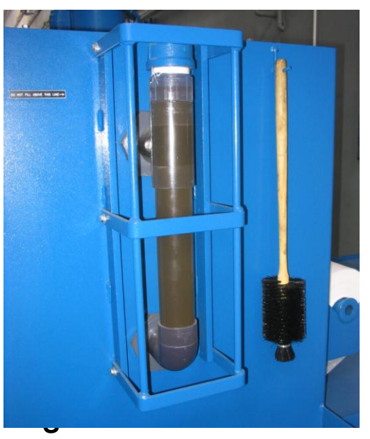
Site Tube & Brush

Empty and rinse the Processor after each use. Never leave solution in the Processor for extended periods. Aggressive chemicals can damage the finish and corrode the tanks. Clean the Sight Tube with the Sight Tube Brush provided with the EQ-1 Processing System.