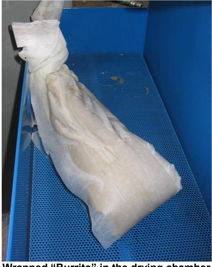
Wrapped "Burrito" in the drying chamber