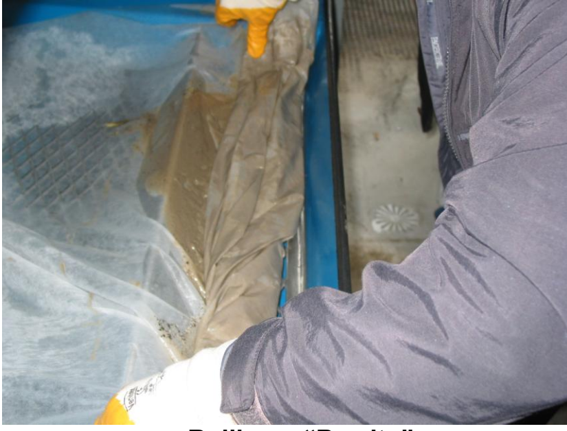
Rolling a "Burrito"

This exposes fresh filter paper and allows you to begin wrapping up the waste in the filter paper.