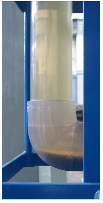
Settled floc in the Site Glass