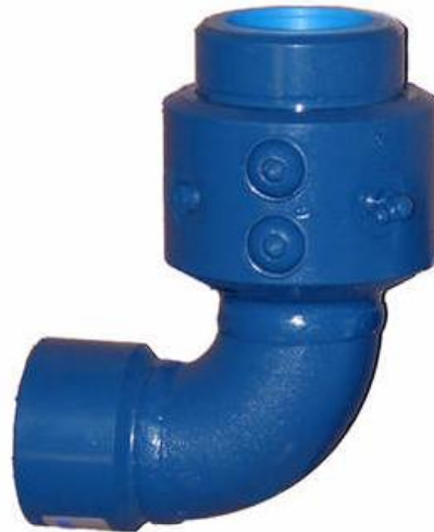
Fig. Non-adjustable Swivel

To adjust the swivel, remove the lock bar. Screw the nut clockwise to the next locking slot or until compression on the packing causes the nipple to rotate with a mild amount of torque. Re-install the lock bar. You may repeat this process until the packing has worn too badly to keep a tight seal.