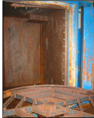
Corrosion Damaged Cabinet