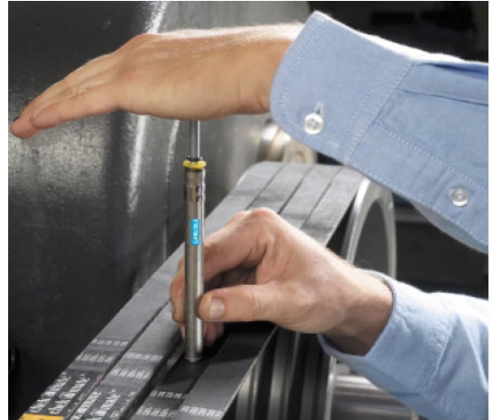
Photo: Belt Tension Checker Use