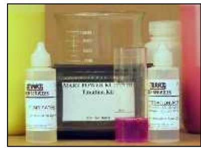
Titration instructions are available at: http://www.marttechservices.com

If your concentration is too weak and you don't know it, you will see a reduction in your cleaning standards and you could begin having corrosion on the walls of your washer. If the solution is too strong and you don't know it, you could be using more soap than necessary and you may not get a good rinse. A titration kit as shown below is available for all recommended Power Kleen detergents. Call MART Tech Services for information.